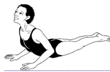
Sivaya Yoga Studio

We are at the corner of Lynnwood Rd and January Masilela Drive (Gen Louis Botha Dr) M33. GPS:25.7688463S, 28.2902788E, or click on Google Earth "Fly to" as Sivaya Yoga Studio.