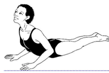
Sivaya Yoga Studio

We are at the corner of Lynnwood Rd and January Masilela Drive (Gen Louis Botha Dr) M33. GPS:25.7688463S, 28.2902788E, or click on Google Earth "Fly to" as Sivaya Yoga Studio.